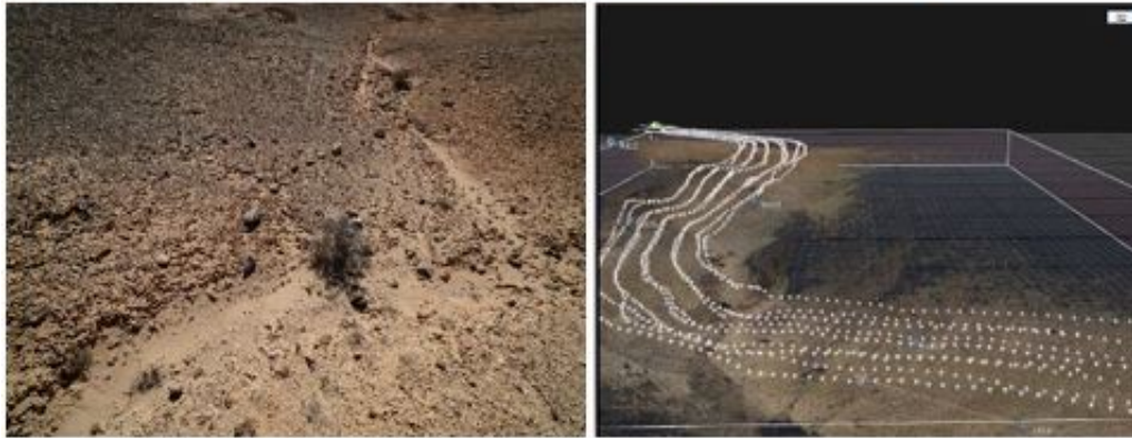
Figure 1: clockwise from top left: Ground Control Point; dGPS measurement of GCP; Example of an input image; registered camera poses in CapturingReality tool